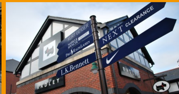
Cheshire Oaks Designer Outlet